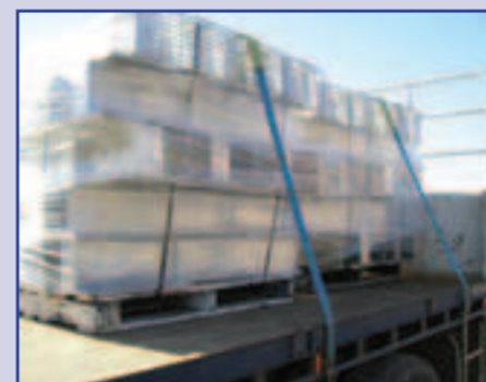
Steel items should be suitably and securely strapped (and/or wrapped) when being transported on pallets.