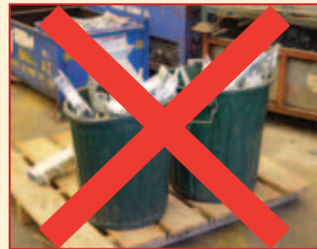
Plastic rubbish bins are unsuitable for the transporting of heavy steel items. The side of the bin splits open.