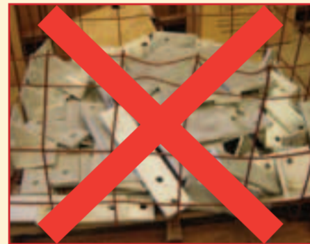
Large open mesh bins are unsuitable for the transporting of smaller items.