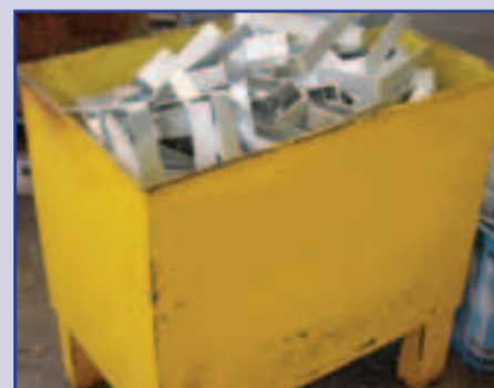
Solid metal bins can accommodate the weight of steel items, are easily transported and can improve manual handling procedures.