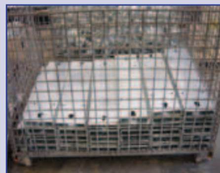
Small items are kept secure in the correct size mesh stillage.