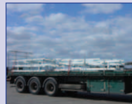
Ensure the work leaving your premises is suitably contained.