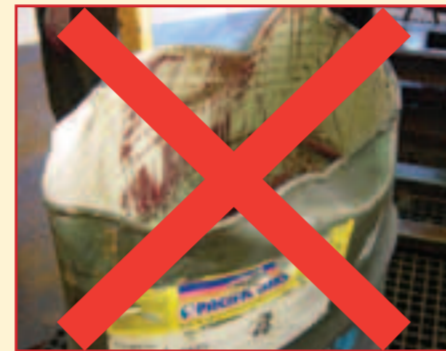
Re-used drums are unsafe. It is impossible to use the correct lifting equipment.