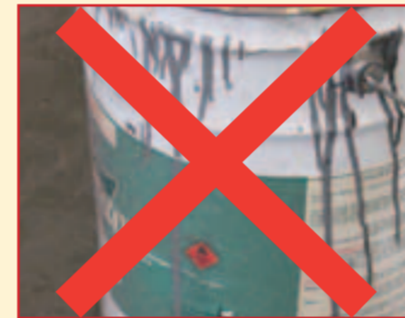
Dangerous goods label still shown